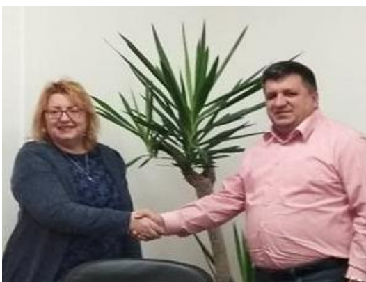
With the Mayor of Maglaj

KAM Association established cooperation with municipalities Maglaj and Doboj Jug on development of anti-corruption plans. The Mayor of Maglaj, Mr. Mirsad Mahmutagić and Mayor of Doboj Jug, Mr. Mirnes Tukić, were happy to accept the cooperation, and have promptly appointed the working group for development of the Action plan for prevention of and fight against corruption. Furthermore, they have passed decisions on conduct of the Questionnaire on self-assessment of susceptibility to corruption, and as result of the decision, the employees have completed the questionnaire. The questionnaire is now to be qualitatively and quantitatively analysed, followed by a workshops to identify strategic directions of the Action plan.