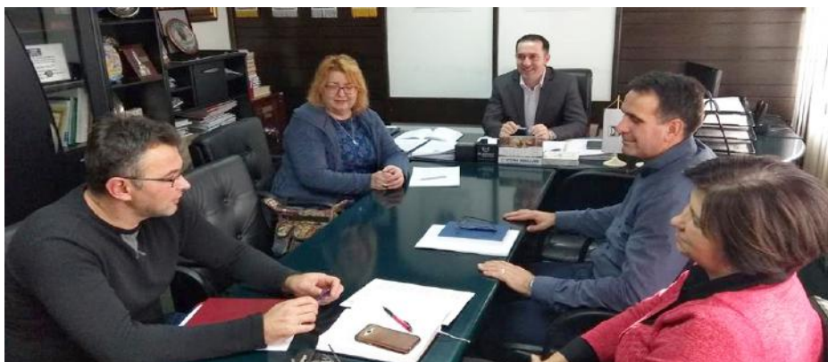
Meeting at Doboj Jug Municipality