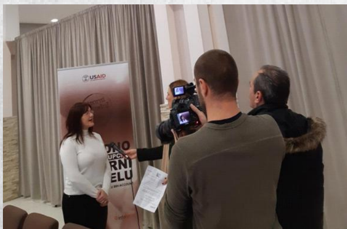
Press conference, Tuzla, December 10, 2018

The Helsinki Committee for Human Rights has under the project “Equal opportunities – transparency of employment in public sector III” and on the occasion of marking the Anti-Corruption Week held a press conference to present Analysis of the legislative framework on employment in public sector in 7 cantons in BiH (Posavina, Goražde, Tuzla, Central Bosnia, Zenica-Doboj, Una-Sana and Canton 10). A short movie on implemented activities in the employment sector was presented at the press conference.