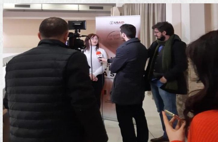
Press conference, Tuzla, December 10, 2018