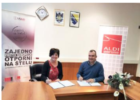
Signing of the Memorandum of Understanding – Fojnica Municipality