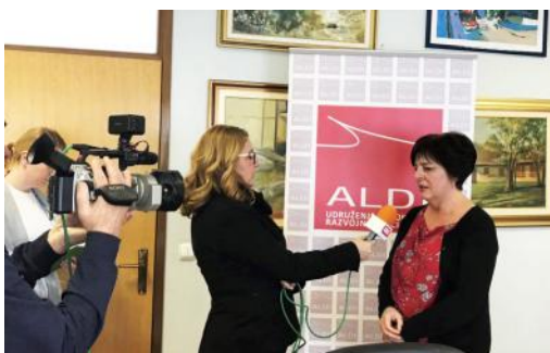
Signing of the Memorandum of Understanding – Kiseljak Municipality