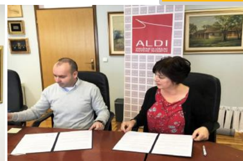
Signing of the Memorandum of Understanding – Kiseljak Municipality

The project is realised by the Anti-corruption Network in BiH – ACCOUNT with the support the United States Agency for International Development (USAID), and implemented by the Association ALDI in cooperation with the INFOHOUSE Foundation.