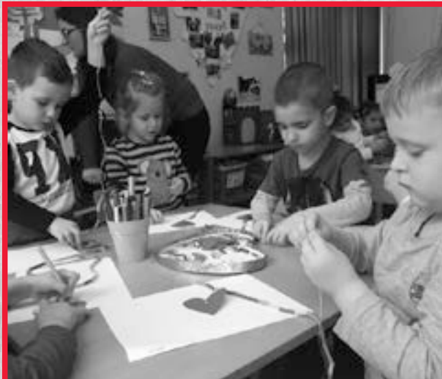
The representatives of INFOHOUSE also visited the children in the kindergarten “Mašnica”

The representatives of the Association ICVA, under the ACCOUNT, have yesterday held a meeting with the representatives of the public healthcare institutions (General hospital prim. dr. Abdulah Nakaš and PI Health Centers of Sarajevo Canton) that were founded by the Government of Sarajevo Canton. The interlocutors discussed experience concerning drafting, adoption and implementation of the Rulebook on prevention of corruption based on the Model of Rulebook that was prepared and proposed by ICVA as part of the project “Rulebook for prevention of corruption in the public healthcare institutions”. Furthermore, the representatives of the healthcare institutions received info material on procedures for reporting of corruption by the patients and the staff of these healthcare institutions.