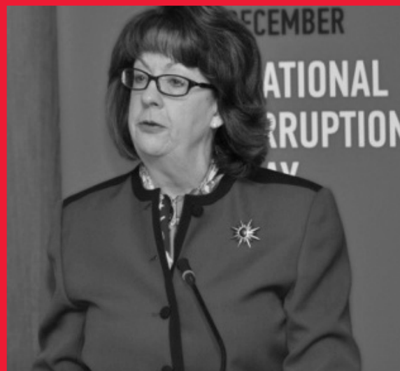
Maureen Cormack, Ambassador of the United States to BiH

"I appreciate the work that the ACCOUNT and Transparency International have done and will continue to do in this area, and the U.S. Government will continue supporting BiH in these efforts. We support efforts of the civil society within the government institutions in developing strong, transparent mechanisms to improve the legal framework of BiH for prevention of corruption and to provide support and to protect the citizens who come forward and report corruption in public sector. Suppression and prevention of corruption is of paramount importance for the BiH to be a stable, and prosperous country that provides equal opportunities to all of its citizens" – said Maureen Cormack, the U.S. Ambassador to BiH. In her speech at the regional conference organized to mark the International Anti-Corruption Day Ambassador added that she is proud of the progress BiH has made in some areas over the year.