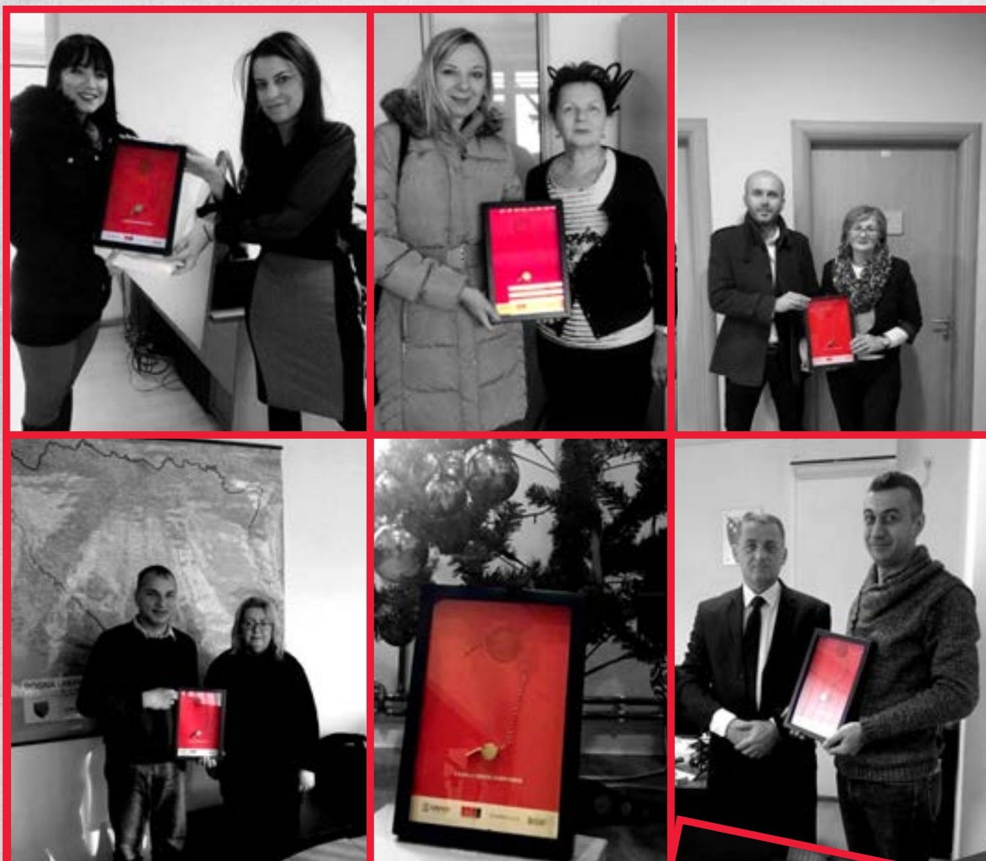
Collage of photos: In case of emergency break glass!