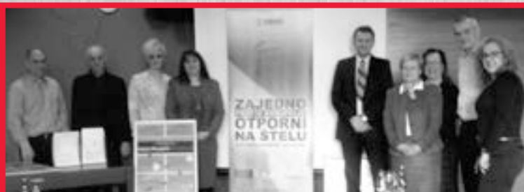
The representatives of the Association ICVA at the meeting with the representatives of the public healthcare institutions