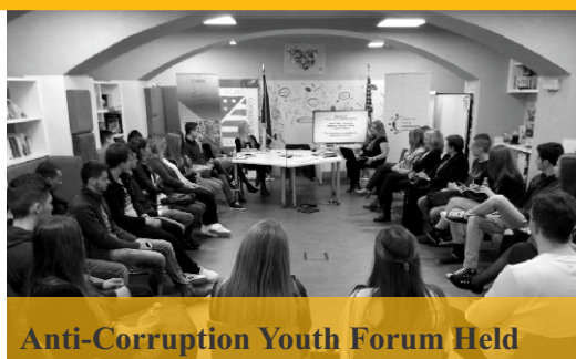
Anti-Corruption Youth Forum Held