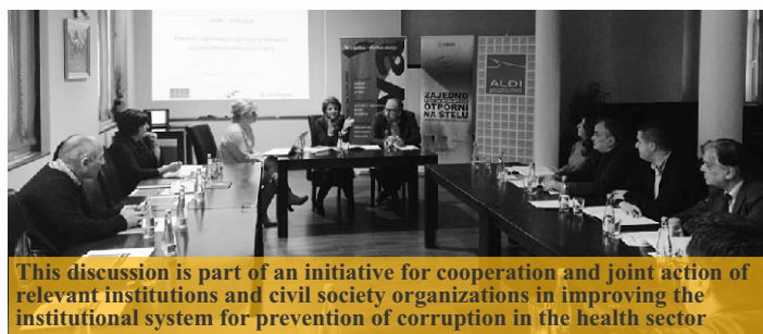
This discussion is part of an initiative for cooperation and joint action of relevant institutions and civil society organizations in improving the institutional system for prevention of corruption in the health sector

On that occasion, ICVA presented a draft of a rule book / policies and procedures for the prevention of corruption in health institutions in Sarajevo and Zenica-Doboj cantons. During the discussion, the participants had the opportunity to provide suggestions and proposals in order to get acquainted with the advantages of introducing such a rulebook.