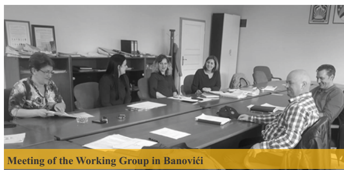
Meeting of the Working Group in Banovići

In March, the third meeting of the Working Group in the Banovići Municipality was held, where the preparation of the Action Plan for the Prevention of Corruption is in the final stage.