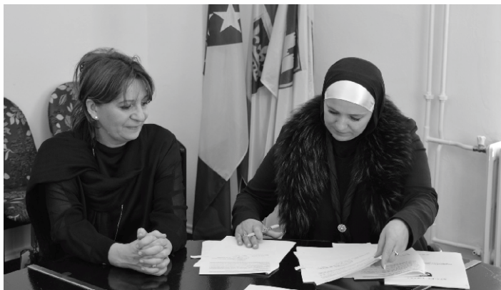
Signing on the Action Plan, Visoko

After completing the quantitative and qualitative analysis of the self-assessment of the areas that are exposed to corruption and workshops on the preparation of action plans for the fight against corruption based on the analysis, the Working Groups of the Travnik and Žepče municipalities have started the preparation of the Action Plans, while Visoko is the first municipality in 2018 that adopted the Action Plan for Prevention of Corruption. The consequences of corruption in practice include poor public services, increased social polarization, inefficiency in public services, low investment in the municipality, reduction of economic growth, inadequate treatment of citizens by municipal officials. Although there is no a unique recipe for combating corruption at the local level, the development of anti-corruption action plans has proven to be a good preventative format.