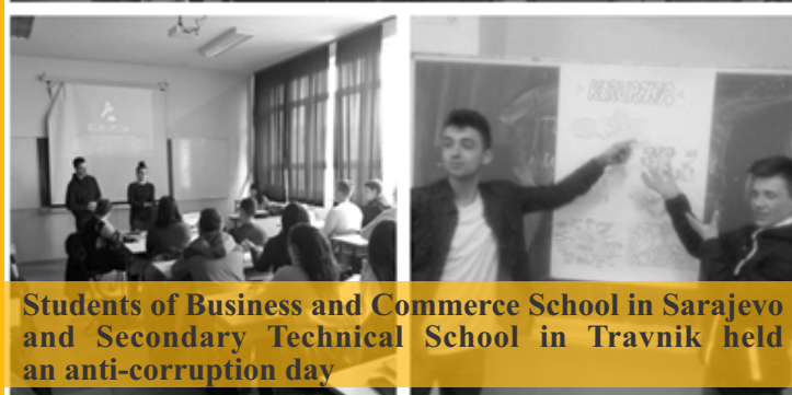
Students of Business and Commerce School in Sarajevo and Secondary Technical School in Travnik held an anti-corruption day