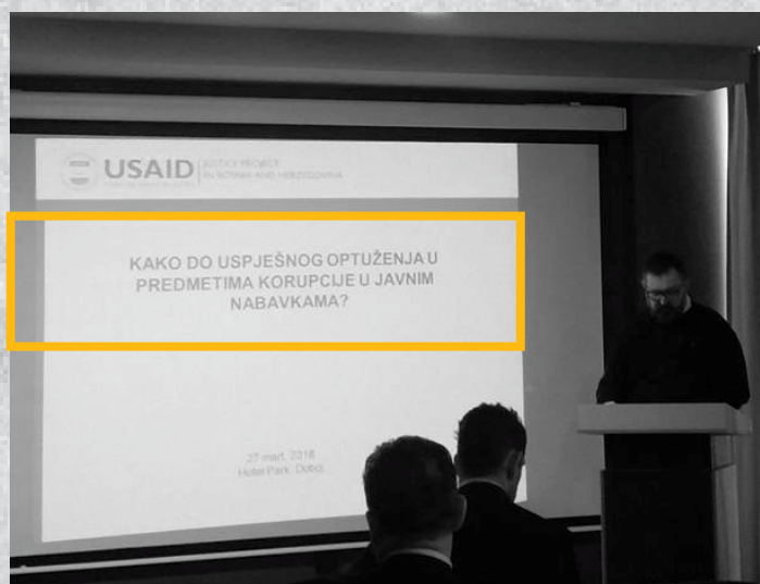
ACCOUNT Media pool

Within the five-month funding cycle, a total of 10 media from Bosnia and Herzegovina, members of the ACCOUNT Media Pool, will be supported. During this period, the media will pay attention to the development of content in the field of investigative journalism in the project areas, raising public awareness of the problem of corruption and empowering anti-corruption initiatives.